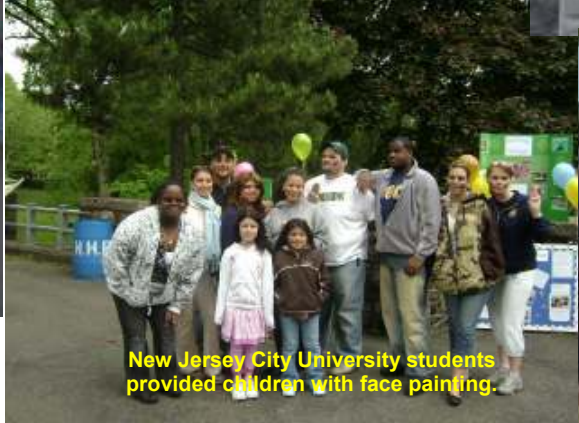
New Jersey City University students provided children with face painting.