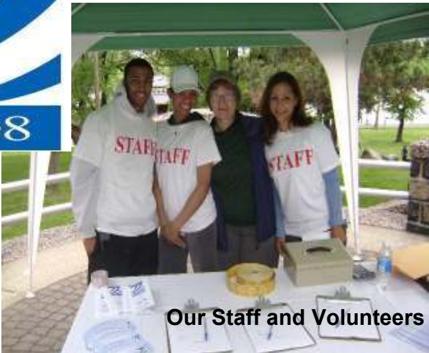
Our Staff and Volunteers