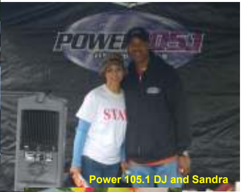
Power 105.1 DJ and Sandra