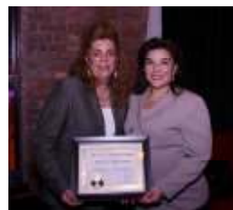
Carmen Guerra & Ilena Marti Memorial High School

Save the Date for our annual "Step Up For the Arc Walk 2008" / Reserva La Fecha y únete a nosotros en nuestra caminata anual para beneficiar a personas con problemas intelectuales y de desarrollo.