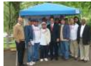
The Free Masons with Senator Brian Stack and Commissioners.

La séptima caminata anual del Arc del condado de Hudson, "Step Up For The Arc Walk 2008" sera el día 17 de mayo de este año en James Braddock Park/ En el Parque de la calle 80. Para información sobre como patrocinarnos llámenos a 201-319-2-9229.