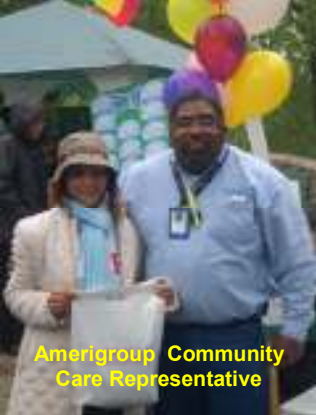
Amerigroup Community Care Representative